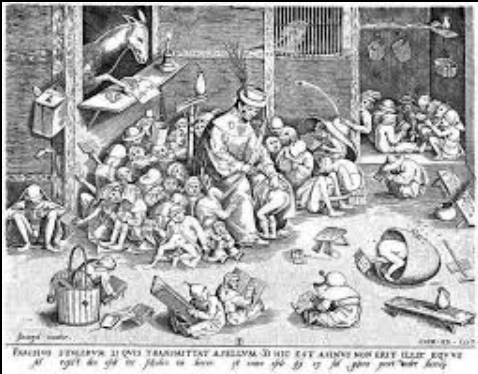
Pieter Bruegel the Elder: The Donkey in the School , 1556